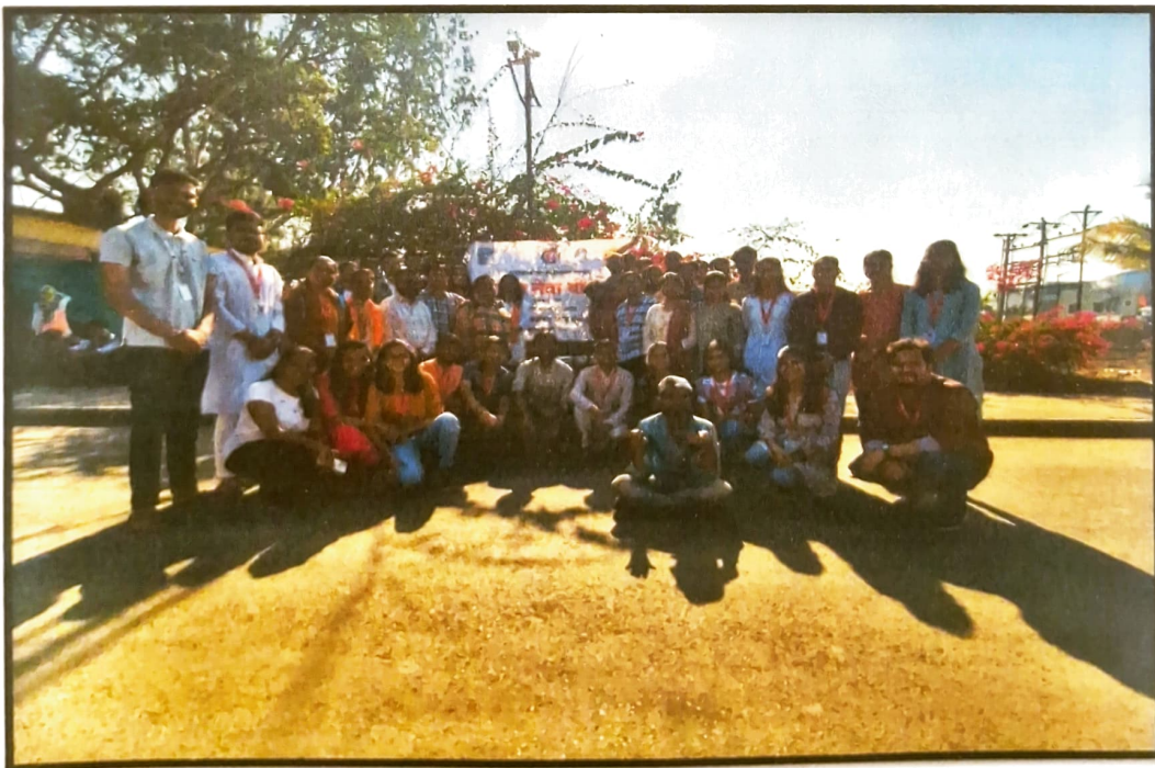
Photograph No 2