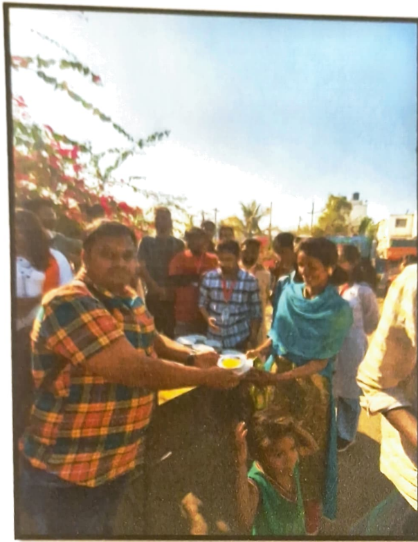
Photograph No 1