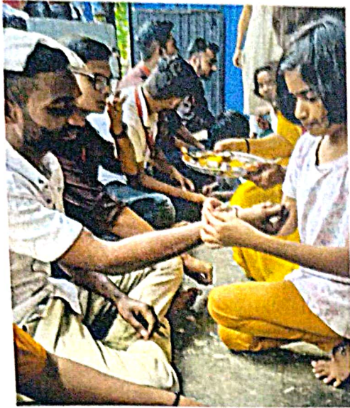
Photograph No 2