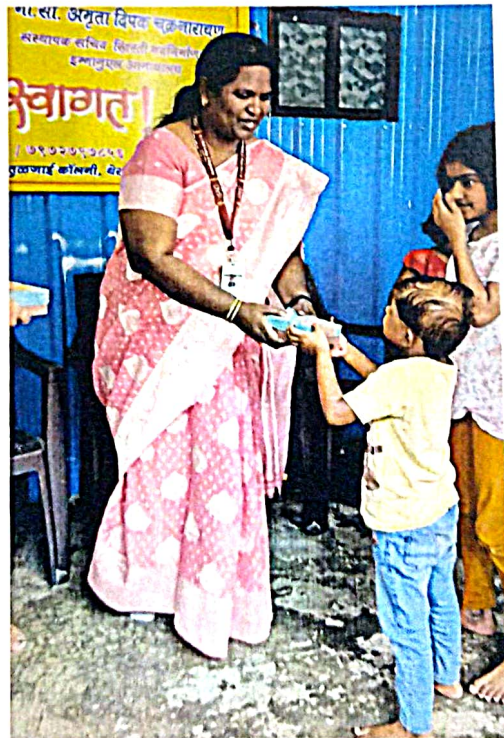
Photograph No 4