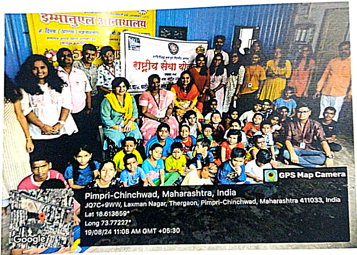
Photograph No 1

The event concluded with a heartfelt note of thanks from the orphanage's management, who appreciated the efforts of the NSS unit in bringing joy to the children. The smiles on the children's faces and the warmth in their hearts were the true indicators of the event's success, highlighting the power of love and community in bringing people together.