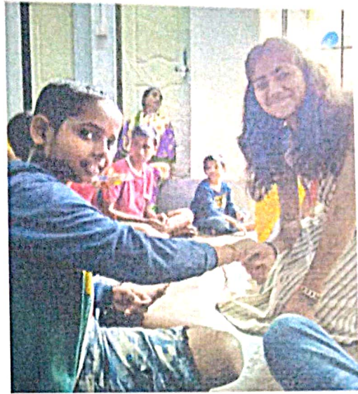
Photograph No 3