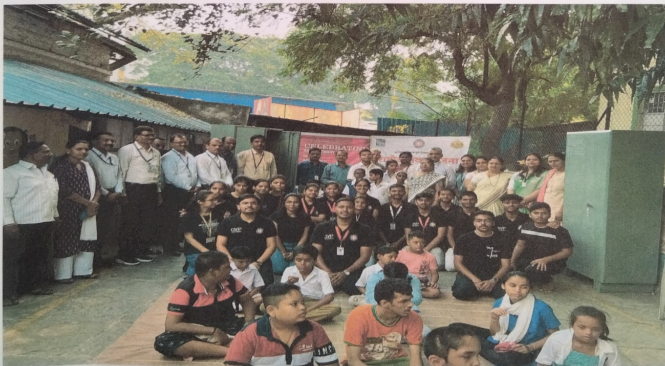
Photo1&2: Respected Memebers & Group Photo