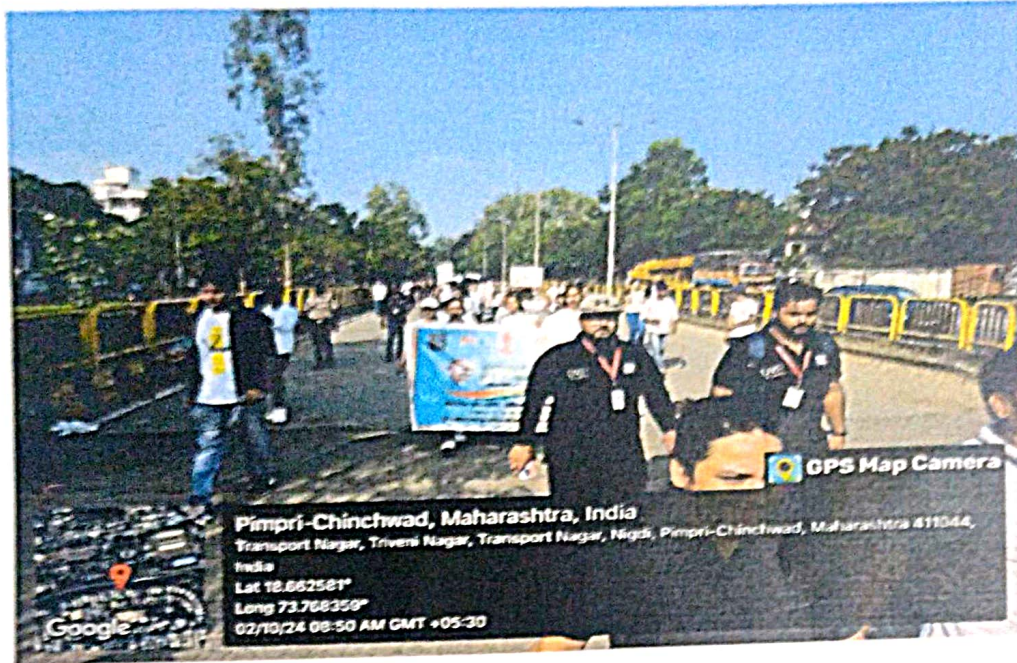
Photograph No. 1