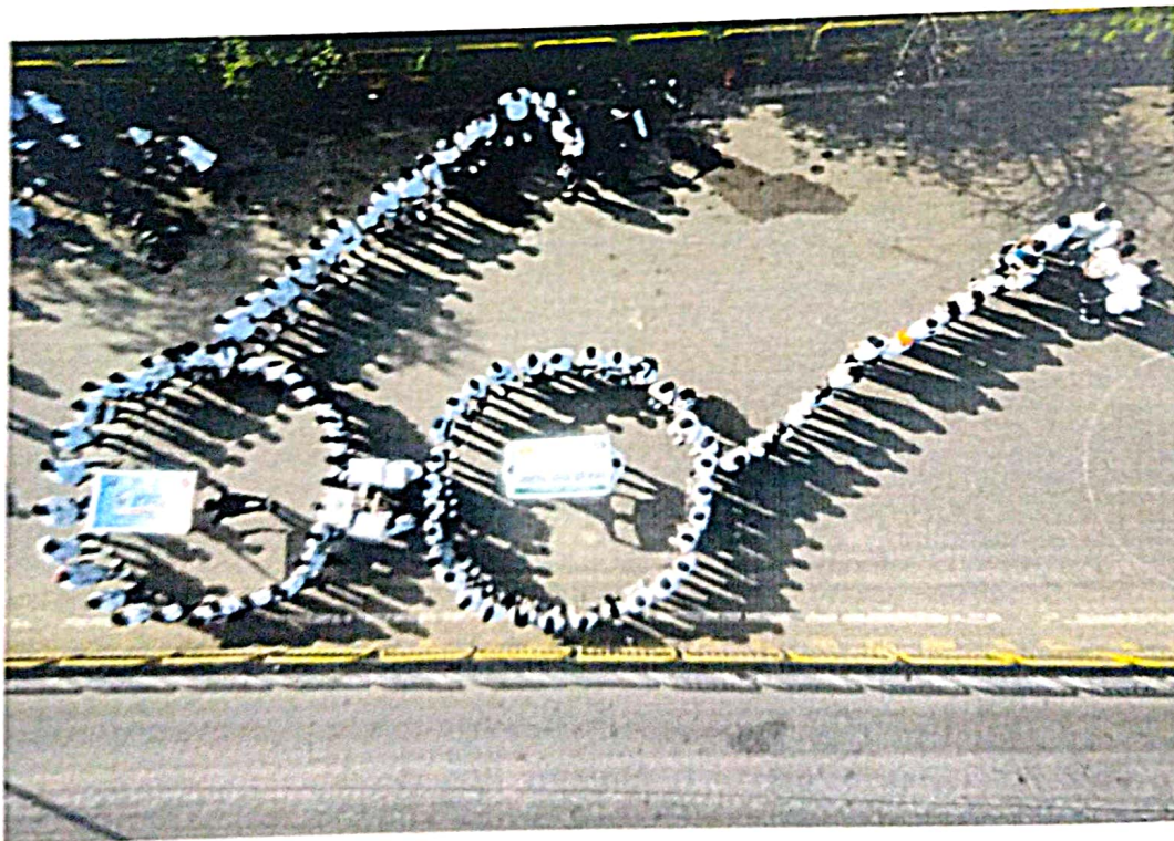
Photograph No. 2