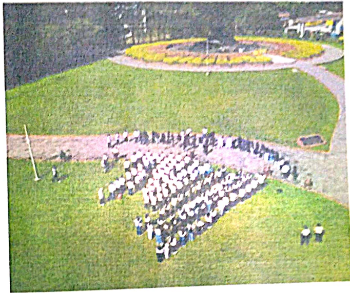
Photograph No. 4