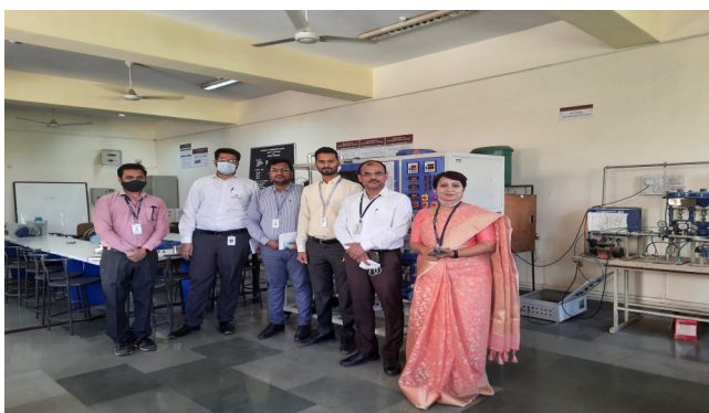
Visit of SKUnitech Pvt. Ltd. Talawade