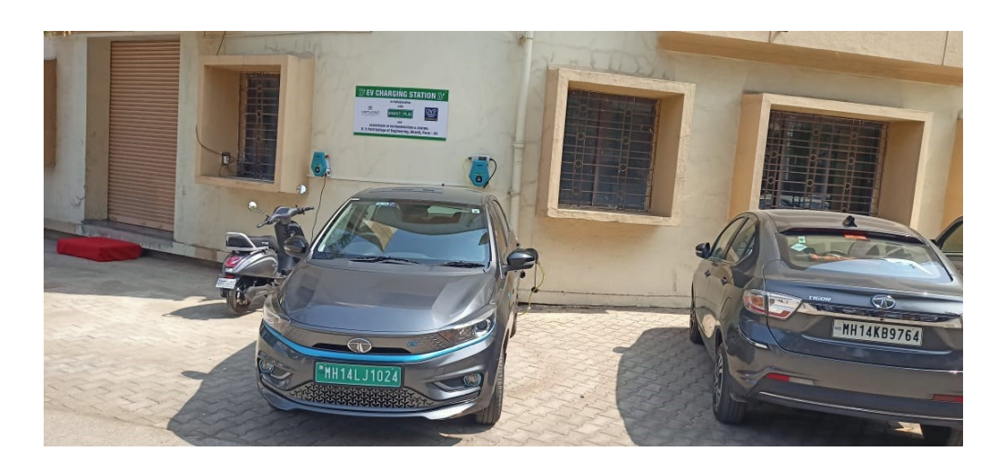
Setup of Electric Vehicle Charging Station