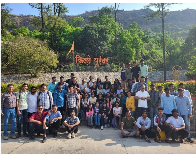
IKS Activity- Visit to Purandar Fort