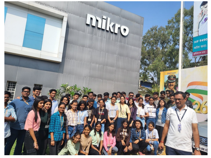
Industrial Visit to Mikro Innotech Pvt. Ltd.