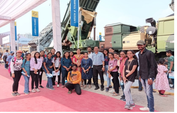
Visit to MSME Expo