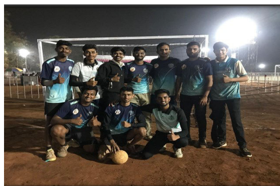
Secured 2nd Place in COEP (Zest 25) Handball competition