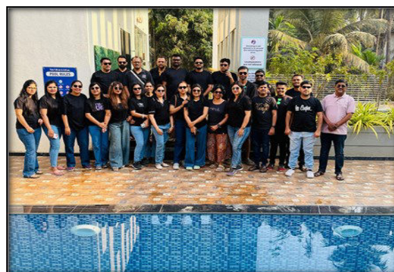
Faculty Welfare Activity at Alibaug on 7th and 8th Feb 2025