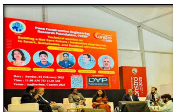
Constro Exhibition by PCERF on 2nd February 2025