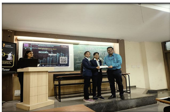
First Prize in Model Mania competition