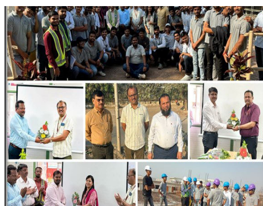
TE Site visit at Govt Medical College and Baramotiche Vihir Satara