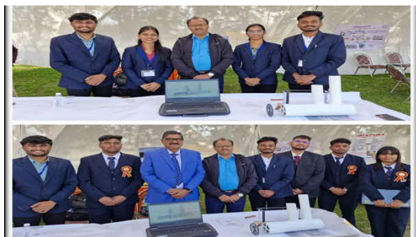
Received Second prize at national level