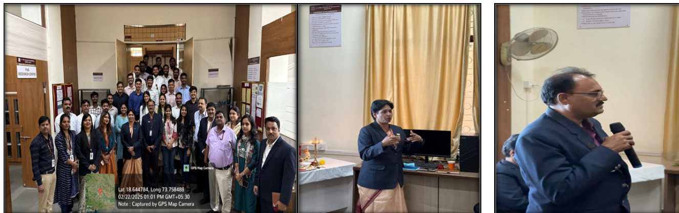
Department level Alumni Meet on 22-02-2025