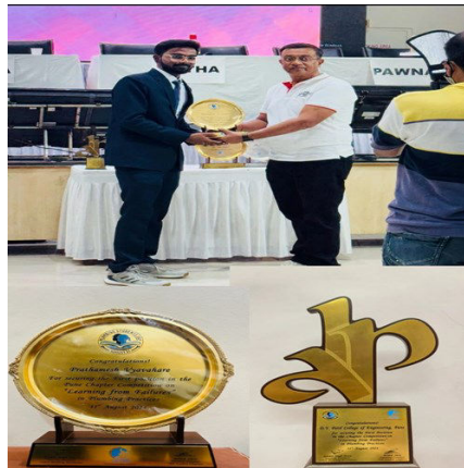
Got first position in Competition on “Learning through Failure”