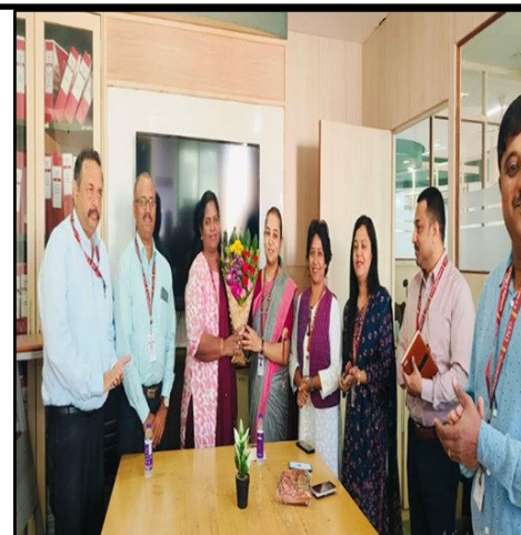
PhD awarded felicitation by Principal