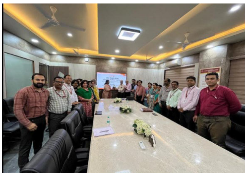
ISO Internal Auditor Training