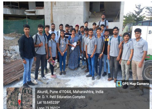
Site visit Conducted