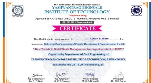
Invited as Resource Person.