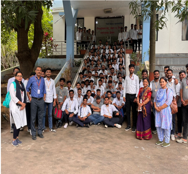
Industrial Visit at PCMC Water Treatment Plant