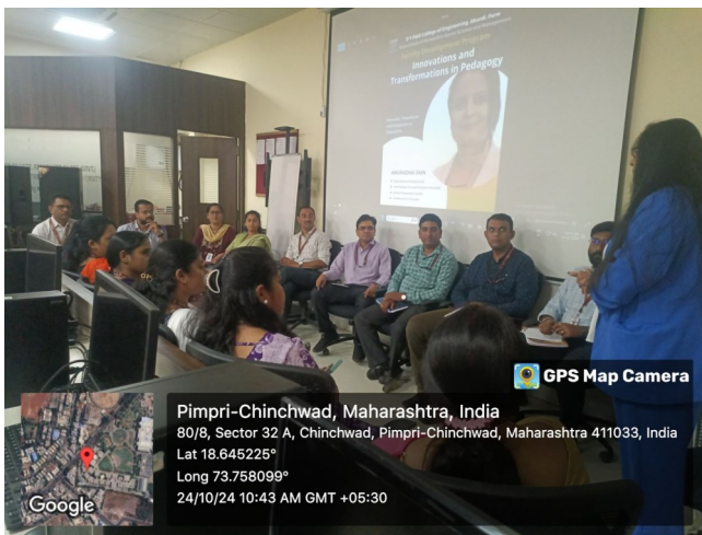
FDP on Innovations and transformation in pedagogy