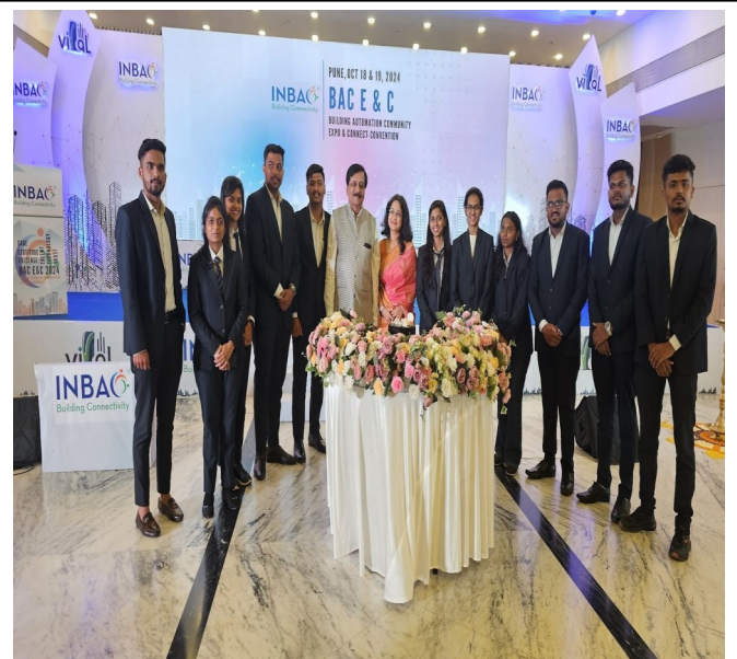
ISA Event: INBAC's Building Automation Community Expo