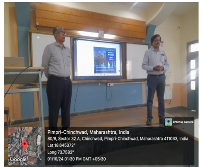
Expert Talk on Building Automation